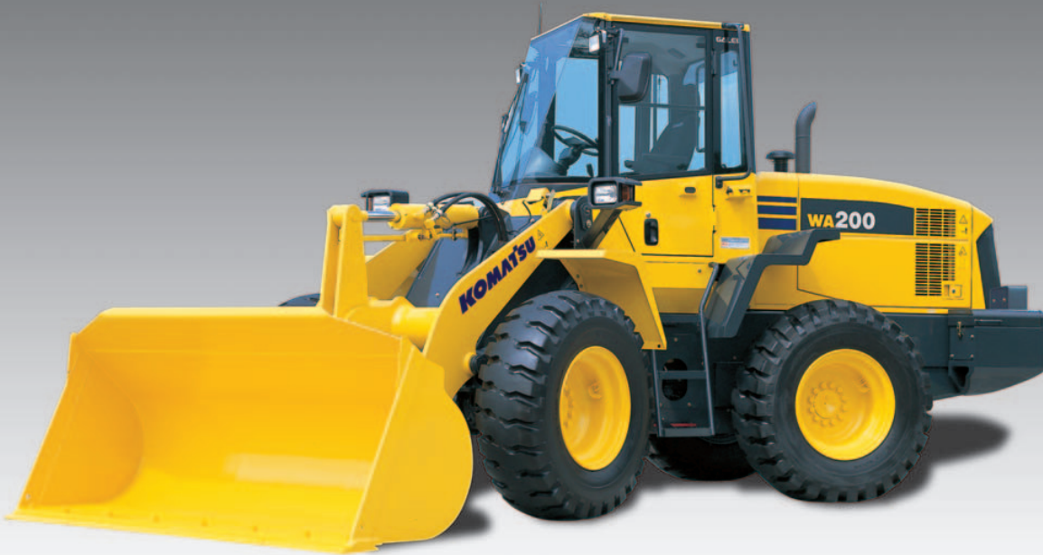
Photo may include optional equipment.